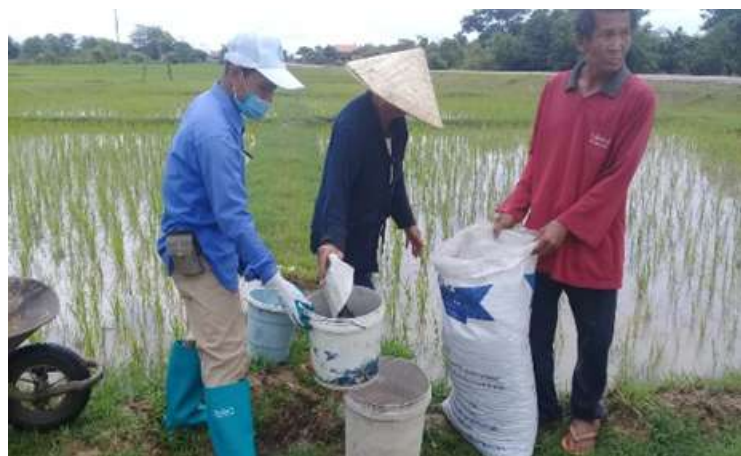
FERTILIZER APPLICATION IN OUTHUMPHONE DISTRICT

They learned to enhance their land's fertility and conserve water by using simple yet effective techniques, such as water retention systems, composting and diversified cropping.