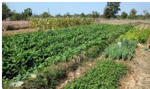
VEGETABLE SELLING IN CHAMPASACK PROVINCE

The project was implemented in 12 villages across six districts in three provinces, directly involving about 30 farm households. The project's objective is to educate and empower these farmers with the knowledge and tools necessary for sustainable farming practices.