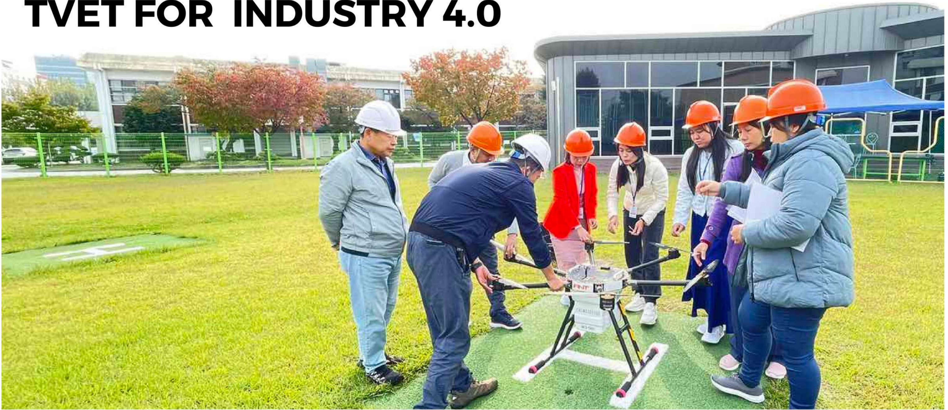
Training of 6 Myanmar TVET teachers in ROK for Drone Technology and IoT

In the age of Industry 4.0, Artificial Intelligence (AI), Internet of Things (IoT) and Drone technologies get into a wide range of applications. While the integration of contemporary technologies into processes can increase performance, efficiency, productivity, connectivity, accuracy, security, and therefore improve living standard of society, wage and income, it can also cause inequality between economic sectors, regions, urban and rural areas as well as between groups of labors due to skill gaps.